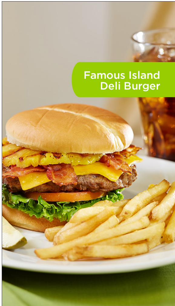
Famous Island Deli Burger