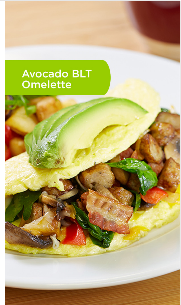
Avocado BLT Omelette

NOTE: Items and prices are subject to change.